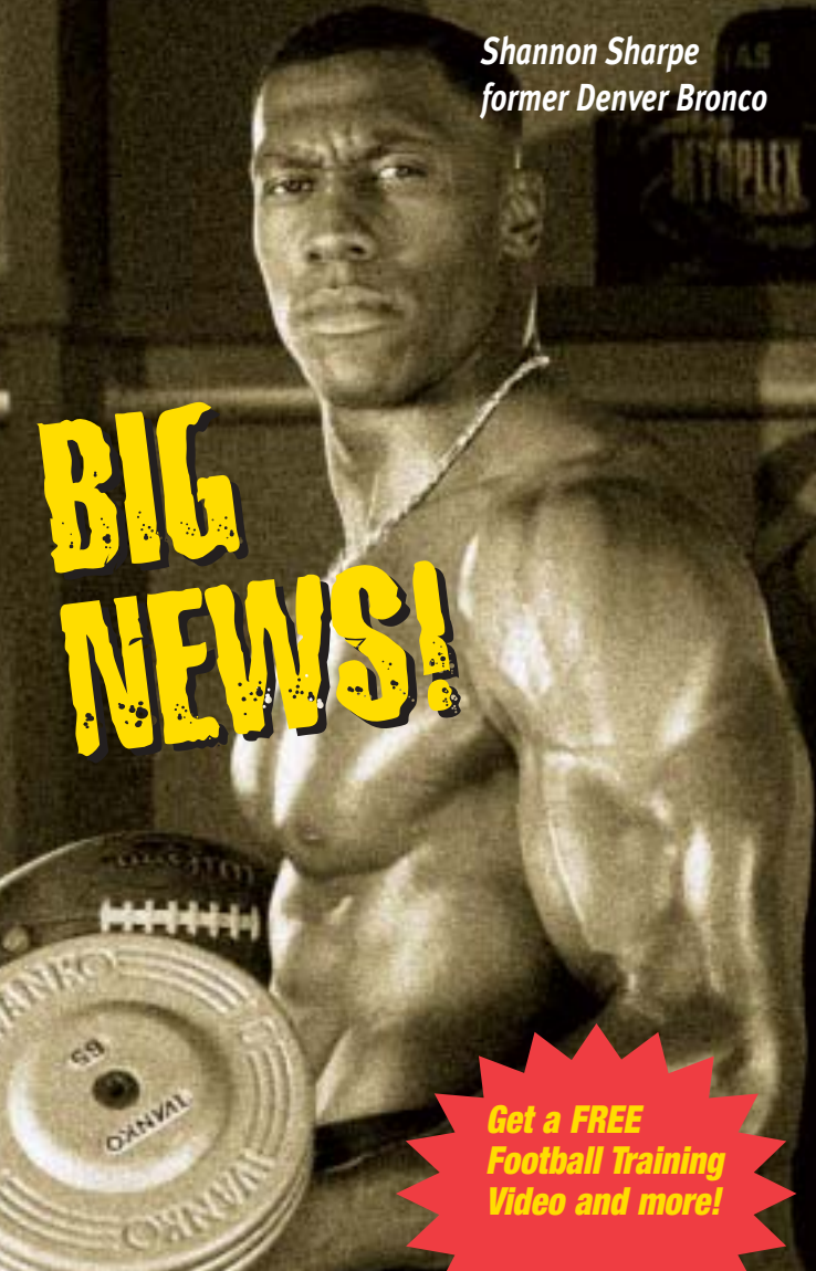
Shannon Sharpe former Denver Bronco